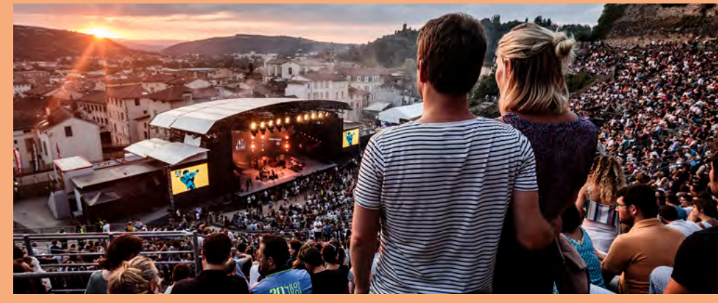
Meet women and men who cultivate their Rhône Valley vines with passion; join them in tasting exceptional wines from Condrieu, Crozes-Hermitage, Cornas, Châteauneuf-du-Pape and more. Make the most of magnificent festivals with views, at Vienne, Valence, Saint-Péray, Orange and Avianon.