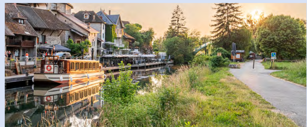
Stop in communes (parishes) boasting a unique heritage: Chanaz, Savoie's Little Venice; the thermal spa towns of Aix-les-Bains and Thonon-les-Bains; and the fortified medieval towns of the Balcons du Dauphiné area, Morestel and Crémieu.