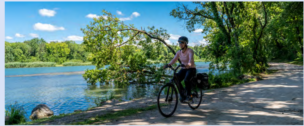
The last stage on this section leads you to Lyon via the Grand Parc Miribel Jonage. Why not take a dip in the waters of the Lac des Eaux Bleues here before immersing yourself in the monumental heritage of the city of Lyon, once ancient capital of the Gauls.