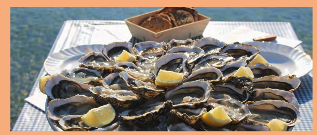
On this final epic leg, savour gastronomic discoveries: Camargue rice; Aigues-Mortes salt; Frontignan's Muscat wine; and oysters from the Étang de Thau and Carteau.