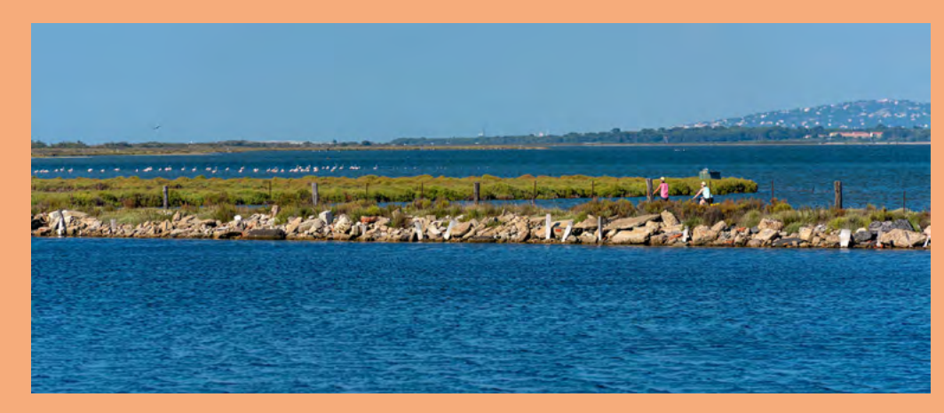
As to the landscapes, from the wild Camargue to the vast beaches of Le Grau-du-Roi and Port-Saint-Louis-du-Rhône, they encourage you to slow down to enjoy moments suspended in time!