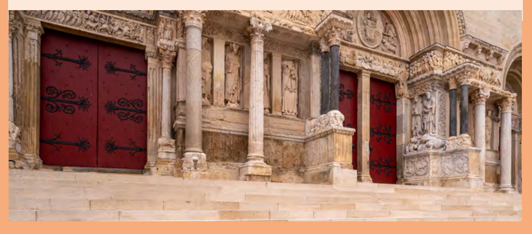
Covering 235 km, it takes you on a splendid trip back in time, from Antiquity at Beaucaire, Arles and Sète, via the Middle Ages at Tarascon and Aigues-Mortes, to a futuristic contemporary space in the form of Luma d'Arles.