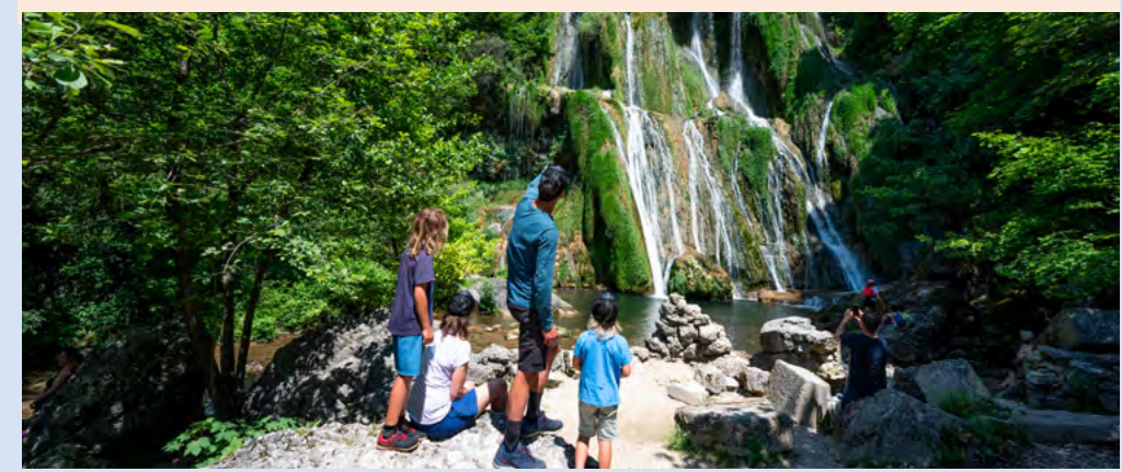
After leaving Lake Geneva, you ride along the borders of the two parts of French Savoie, and then the Bugey area, passing close to mountains, with lakes, gorges and La Balme's startling caves in which to cool down.