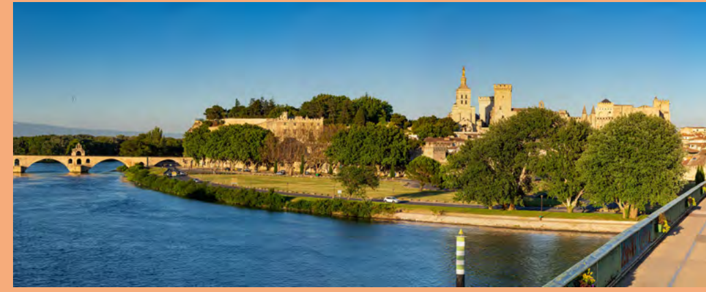
At the end of this section, France's papal city reserves a whole host of surprises: in one of Avignon's many theatres; on its famed bridge; in its Papal Palace, a UNESCO World Heritage Site – all evoking a host of history and stories.