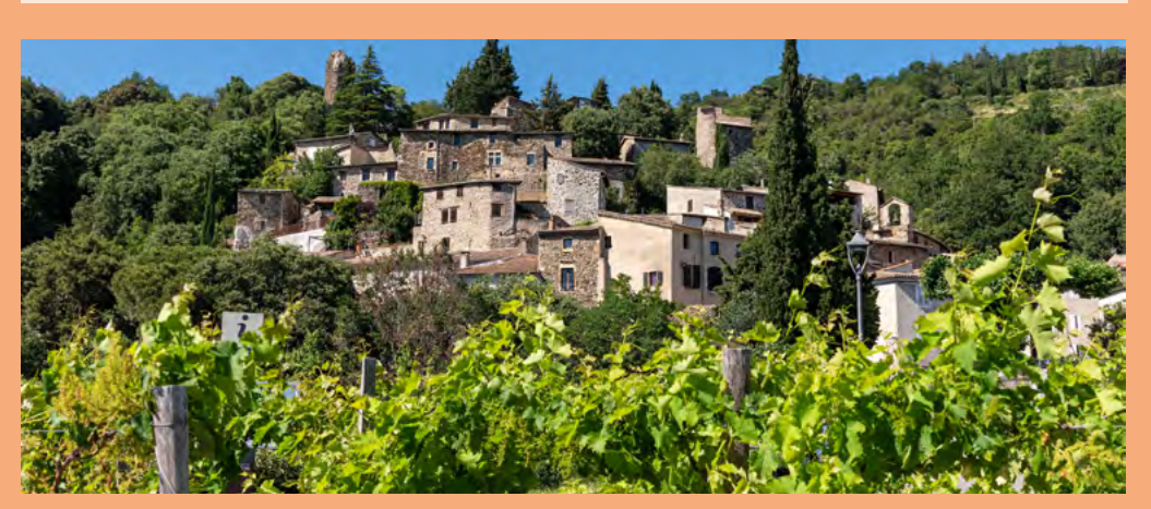
Covering 305km, it unveils an exceptionally rich heritage, from major Roman settlements at Lyon, Vienne and Orange to perched medieval castles as Beauchastel, Rochemaure and Mondragon, plus character-filled little villages full of southern scents.